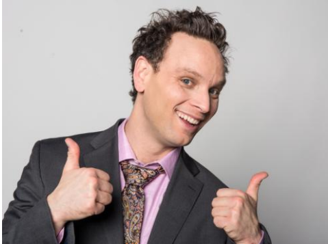
This guy's obviously happy.