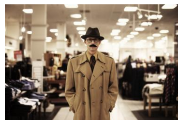
Uh ... is that a man with a moustache?