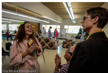
Meanwhile, back at the asylum.