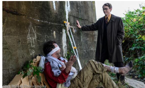
He may be down, but he's not out!