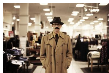
Uh ... is that a man with a moustache?