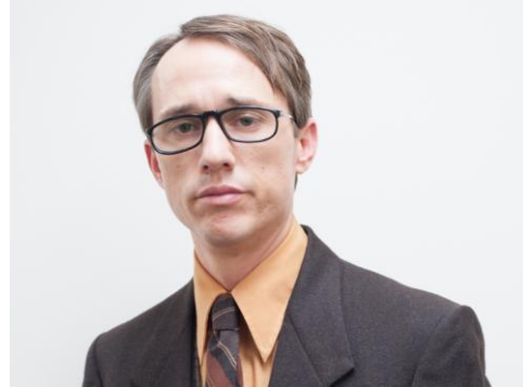
This guy's obviously not.