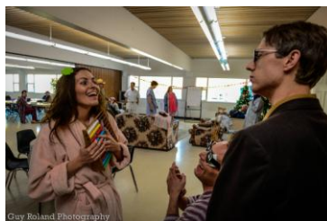
Meanwhile, back at the asylum.