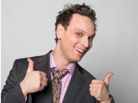
This guy's obviously happy.